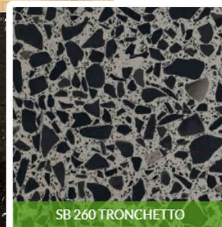
SB 260 TRONCHETTO