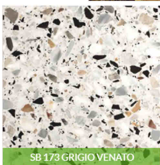
SB 173 GRIGIO VENATO