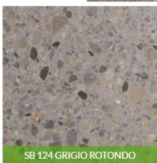
SB 124 GRIGIO ROTONDO